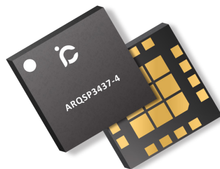
16 Pad 5 × 5 mm 2 LGA Package

This amplifier is part of iCana's high-efficiency 4 W PA RF product line designed for Wireless Infrastructure supporting major 3GPP bands.